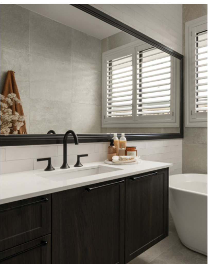
We'll build you the house that's all you want in a home.